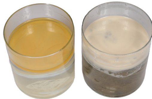
Test samples: Container on left shows untreated oil and water. Container on right was treated with Ultra-Archaea and shows that only lipids were left after the bio-remediation took place. The dark material in the bottom of the container is the clay carrier.

Ultra-Archaea products should be stored and applied between 32°F and 120°F (Ideal temp is 40°F - 110°F). Temperatures outside that range may cause the microbes to become ineffective. Ultra-Archaea should not be exposed to radiation. Ultra-Archaea should only be used in applications where the pH is between 5.0 and 8.5. Visit our website, www.Ultra-Archaea.com to view our FAQs and test data.